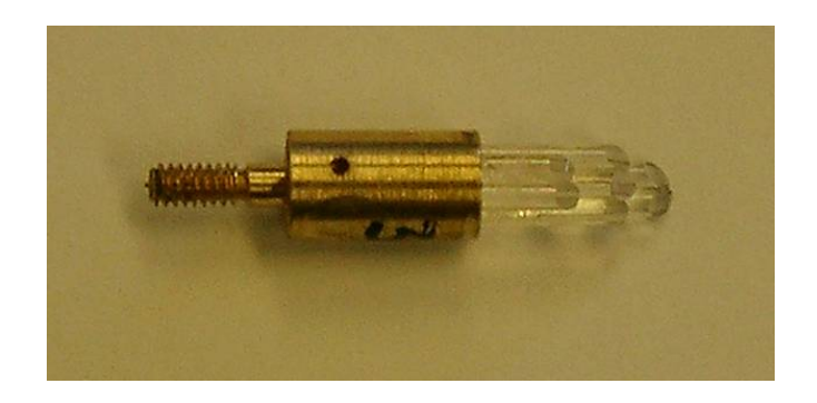
Fig.3. Foto of STAR bundle.