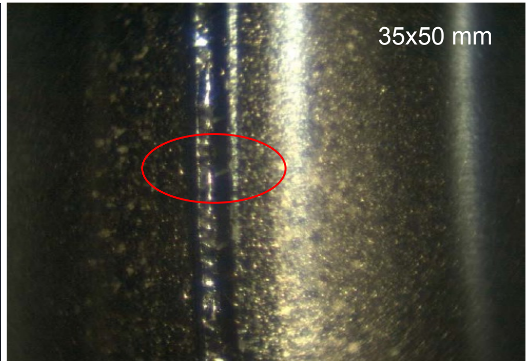
DESY: picture at 42 deg