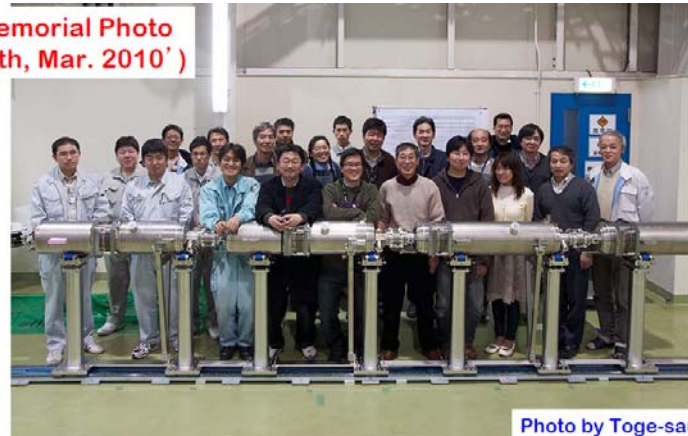
Memorial Photo (8th, Mar. 2010')