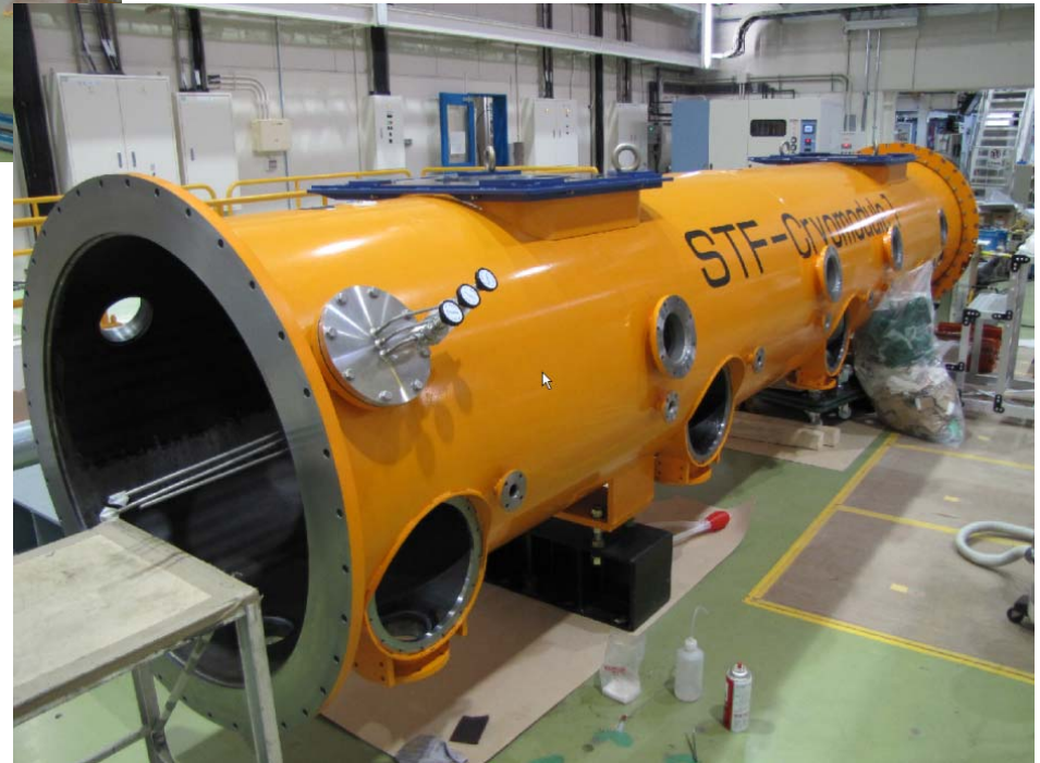
Preparation for assembly of Module- A vacuum vessel