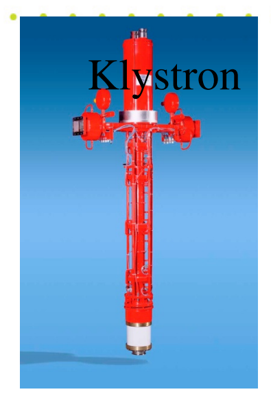
RF Waveguide Distribution