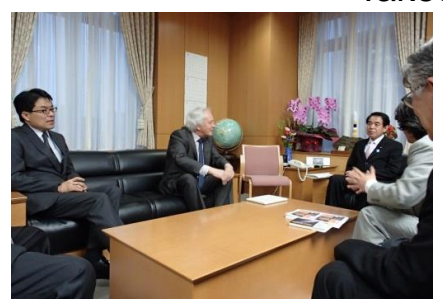
Mr.Shimomura, Minister of Education, Culture, Sports, Science and Technology,