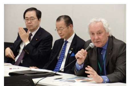
Lecture at Diet member caucus for ILC