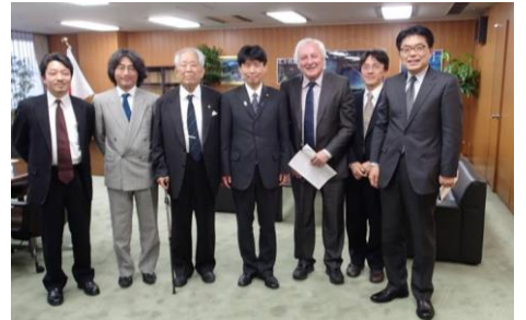
Mr. Yamamoto ,Minister of State for Science and Technology Policy,