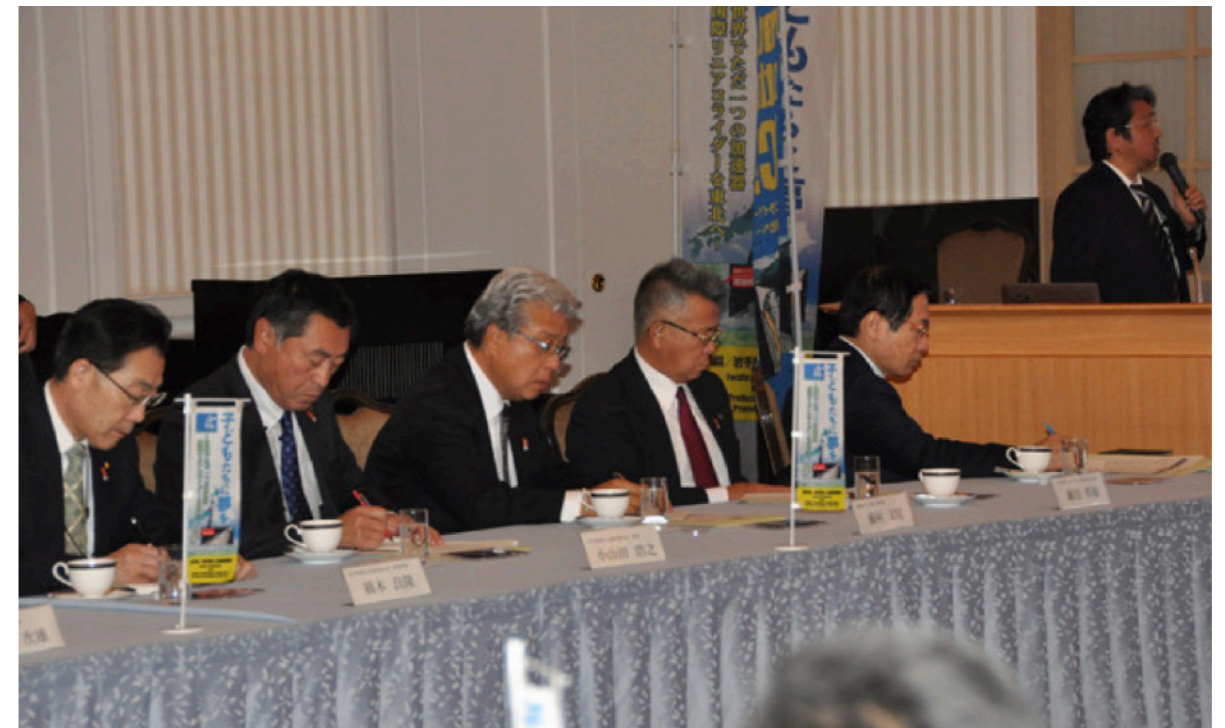
Tokyo Liaison Meeting set up From Iwate-Nippo, Dec.13, 2020